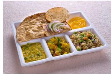
Pre Pack Meals